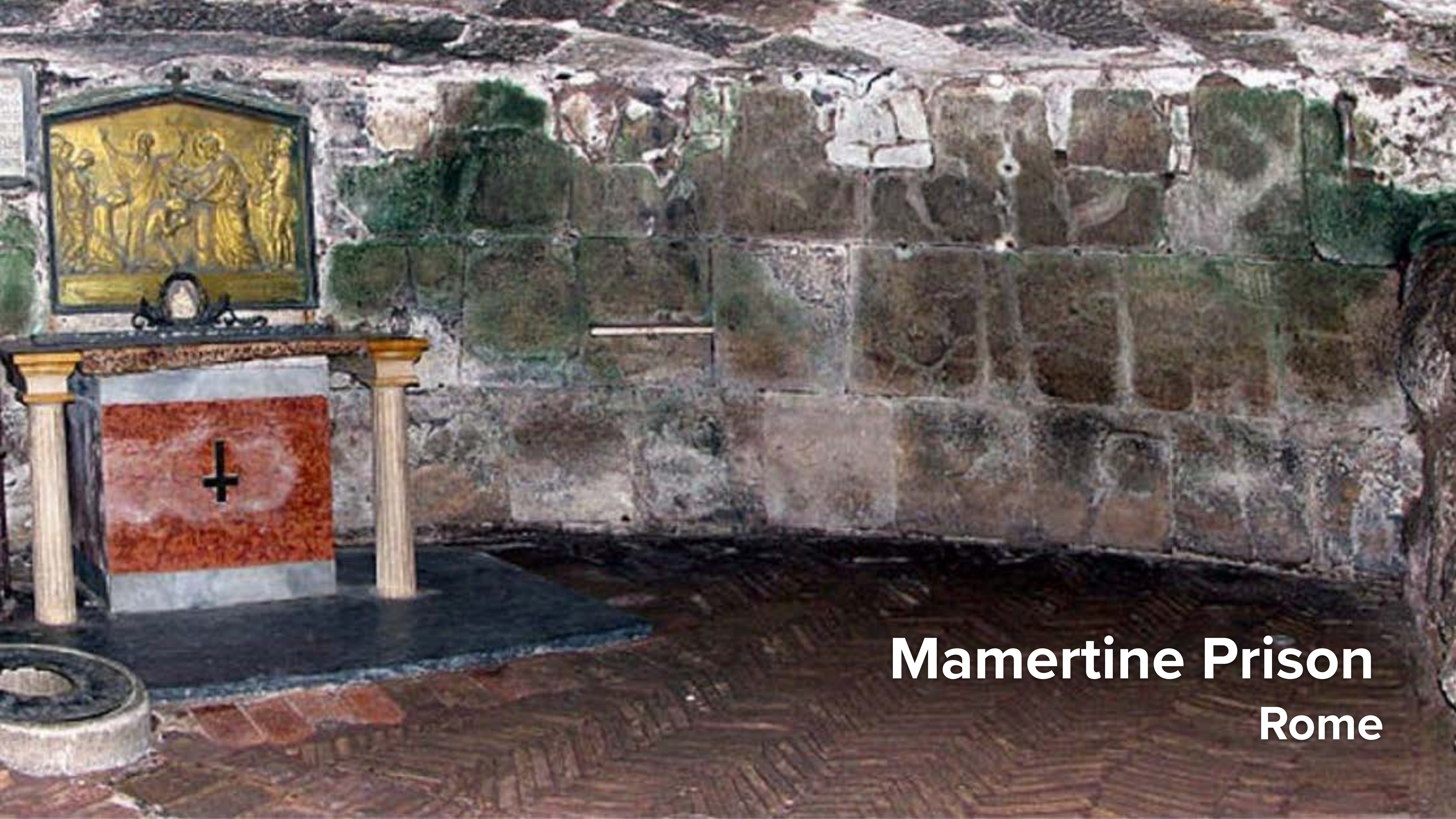
Mamertine Prison Rome